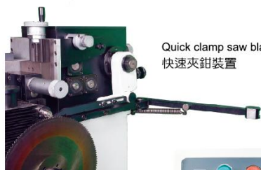
Quick clamp saw blade device 快速夾鉗裝置